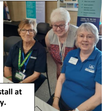
Members manning the stall at Mandurah's Senior's Day.