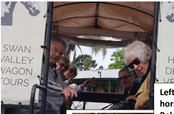
Left: Members on board the horse drawn wagon. Below: Morning tea anyone?