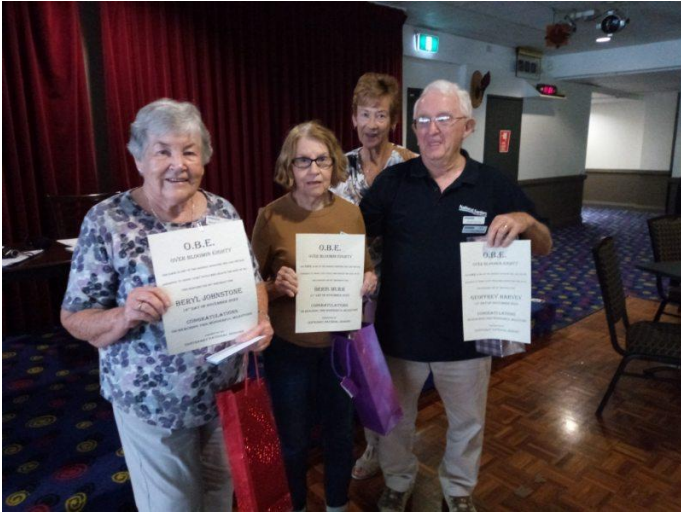
Our latest recipients of an OBE. (Over blooming 80)